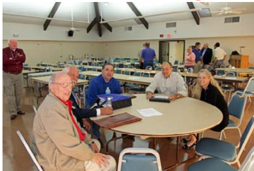
Share Committee Meets at the Seminar