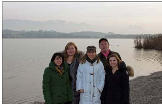
Photo of Inbound Team

The inbound medical team from District 1840 Bavaria, Germany arrives 4/4/13! Please meet the German team!