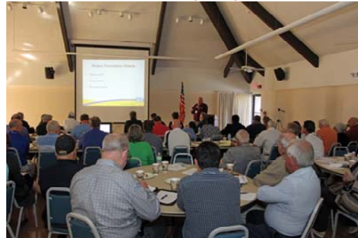
A Full House – with 94% of clubs attending!